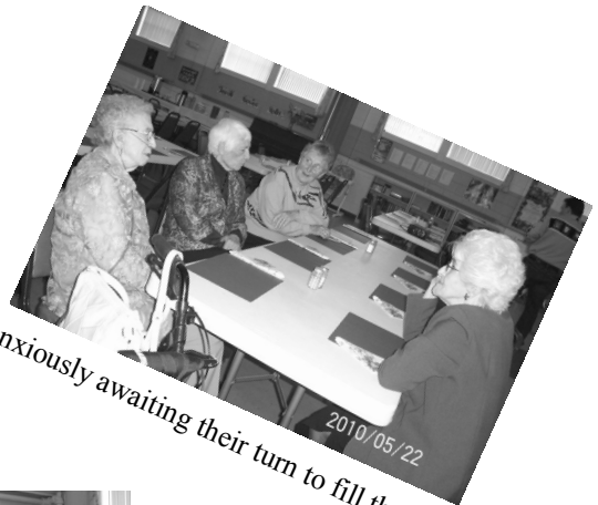
Ladies anxiously awaiting their turn to fill their plates