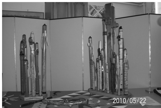
Display of Native American Flutes which were played. The music was very relaxing and the tone of the flutes was beautiful. Sorry so many missed the opportunity to hear this presentation.